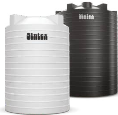
CCV - Series