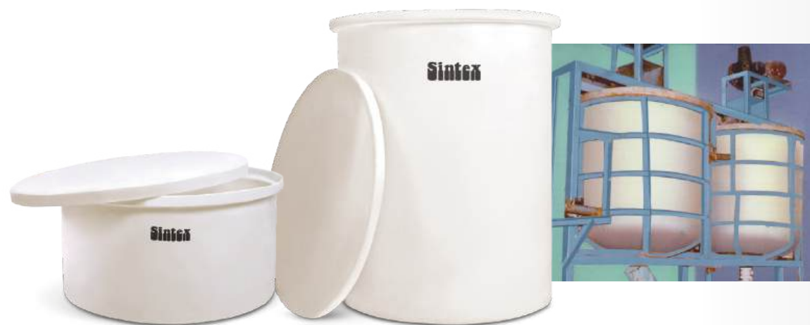
CV & CVD - Series