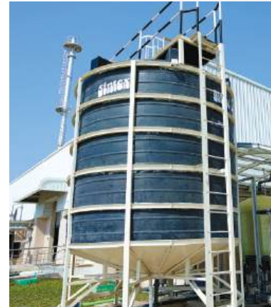
CVC - Series