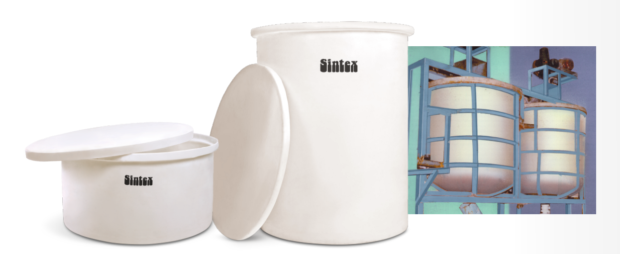
CV & CVD - Series