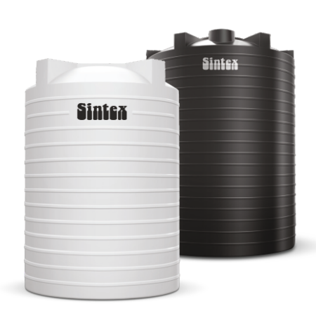
CCV - Series